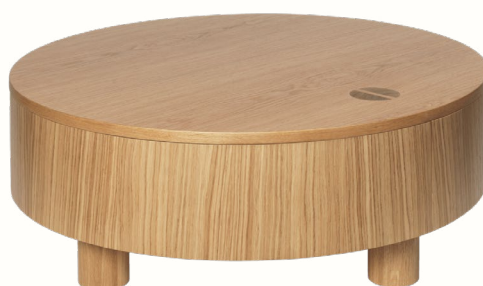
1104271044 Natural Oak Veneer

The Olles Storage Table combines form and function, skillfully crafted with FSC™-certified solid oak legs and oak veneer. Its clean, rounded geometry and four sturdy legs provide stability while lending the piece a sense of effortless lightness. Designed with a pivoting top that opens smoothly, it reveals ample storage space, perfect for organising living room essentials, textiles, and treasured knick-knacks.