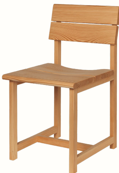
1104271163 Douglas Fir

The Vist Dining Chair is a considered exploration of FSC™-certified Douglas fir, emphasising the material's natural beauty and inherent strength. Inspired by the on-site joinery and millwork at Can Lis, its form achieves a delicate balance between rustic domesticity and lightness. The gently rounded seat and curved backrest highlight the thoughtful craftsmanship behind the piece, making it a timeless addition to any setting.